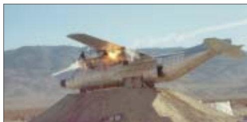
NAVAIR China Lake's Survivability Division conducted a vulnerability test of a C-130 aircraft by firing a live Stinger missile at it.

The combined group has a long and dedicated history of developing survivability technology and getting it applied to aircraft through the Vulnerability Reduction and Susceptibility Reduction Subgroups. An example of the technology promoted by the Vulnerability Reduction Subgroup is the OBIGGs. This subgroup played