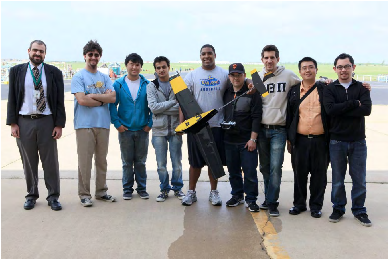
First Place Winner: San Jose State University: Team PhalanX.