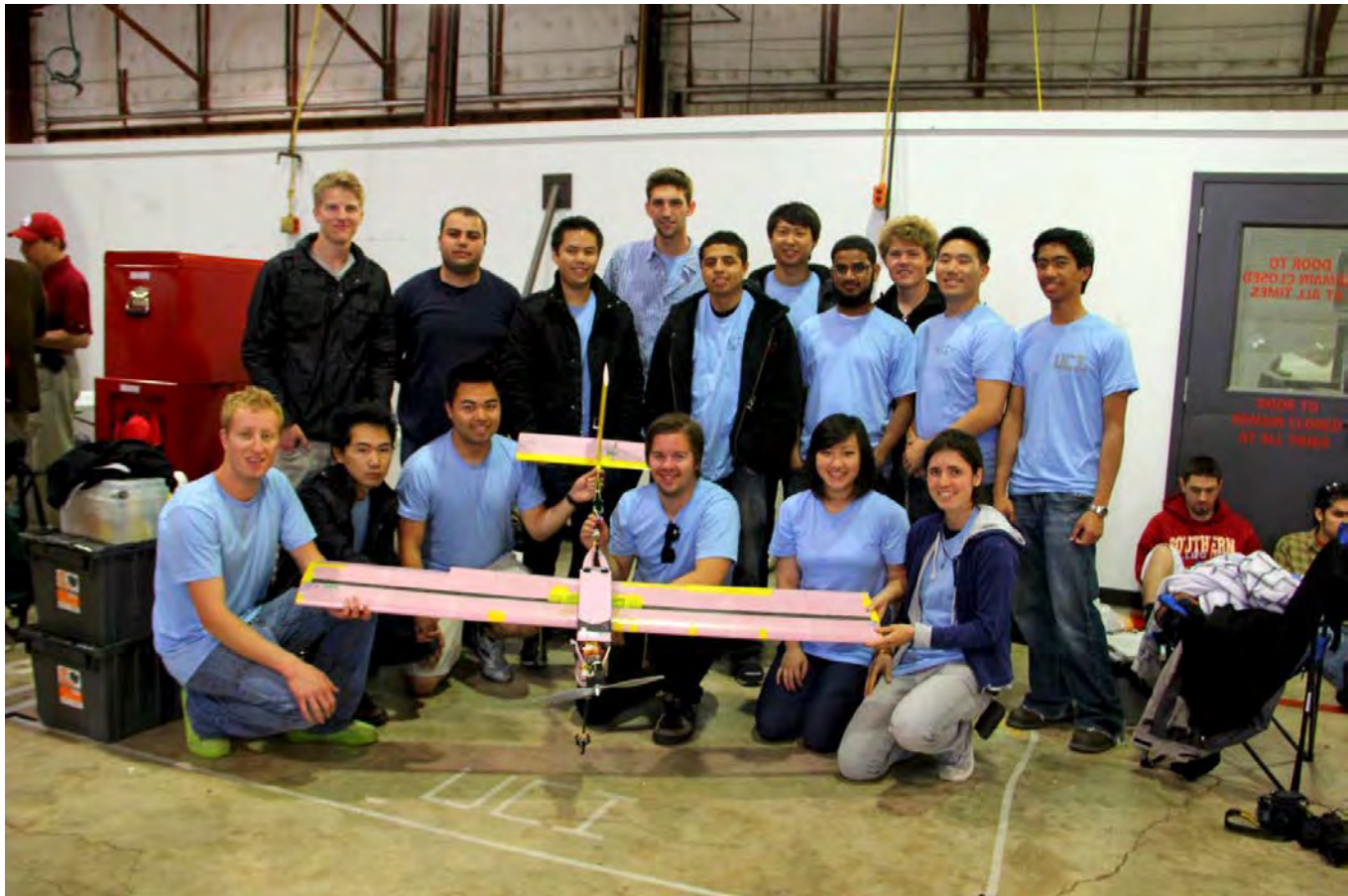
Second Place Winner: University of California at Irvine: Angel of Attack.