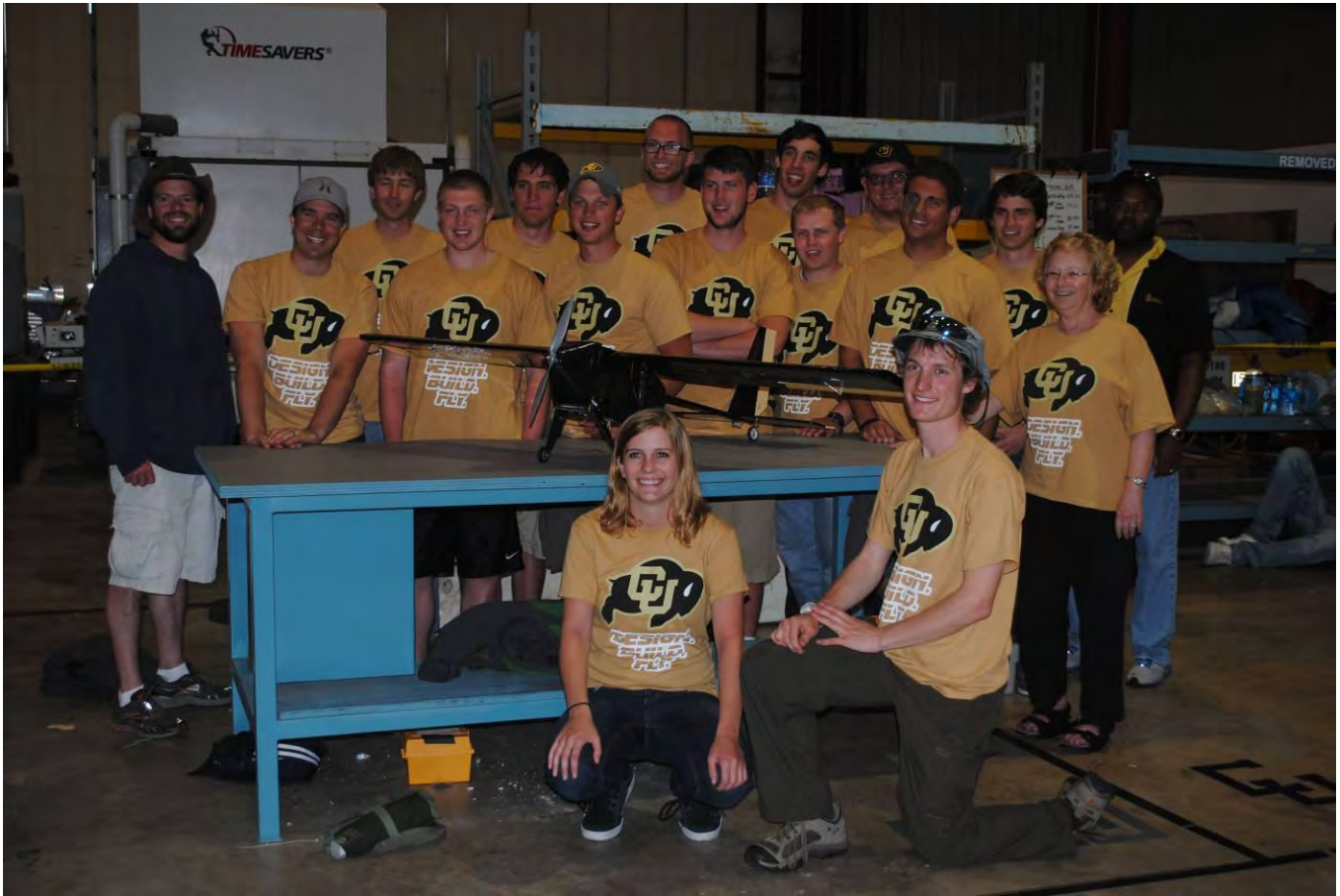
Third Place Winner: University of Colorado: H2Buffalo.