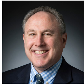
Parker Solar Probe Program Manager, Managing Executive for the Johns Hopkins Applied Physics Lab Space Sector