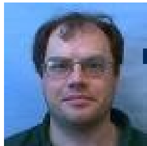
Dragonfly Mission Architect, Planetary Scientist at the Johns Hopkins Ap- plied Physics Lab