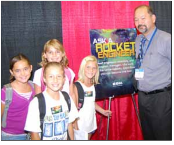
Clockwise from left: An "Engineers as Educators Workshop"; "Ask a Rocket Engineer"; potential future scientists and engineers at Education Alley activities.